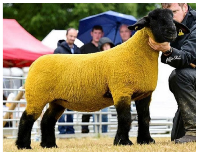
Lot 14: CZK:23:01105: 1st prize gimmer, Reserve Female Champion and Reserve Supreme Champion National Championships, Dundalk. Dam has bred rams and females to 1800,1700, 1600 twice and from a strong Castleisle family with rams selling to 16000, 4300, and 2700.

All ewes are on the heptavac p programme and have been vaccinated for Enzo and Toxo.