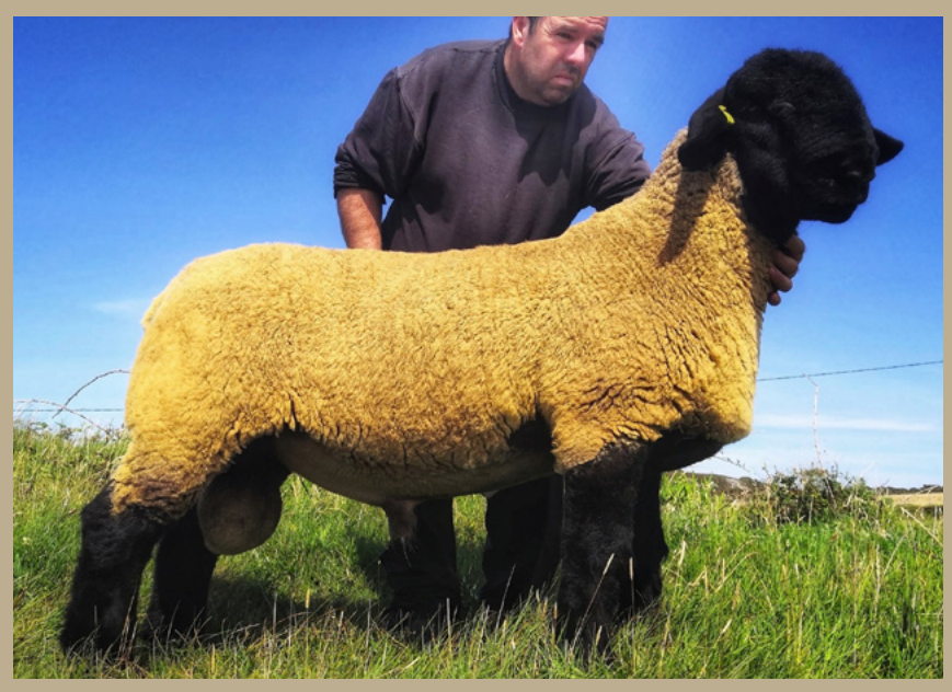
Crewelands Dancing Brave: Service Sire for Malinhead/Cionn Mhala flocks.