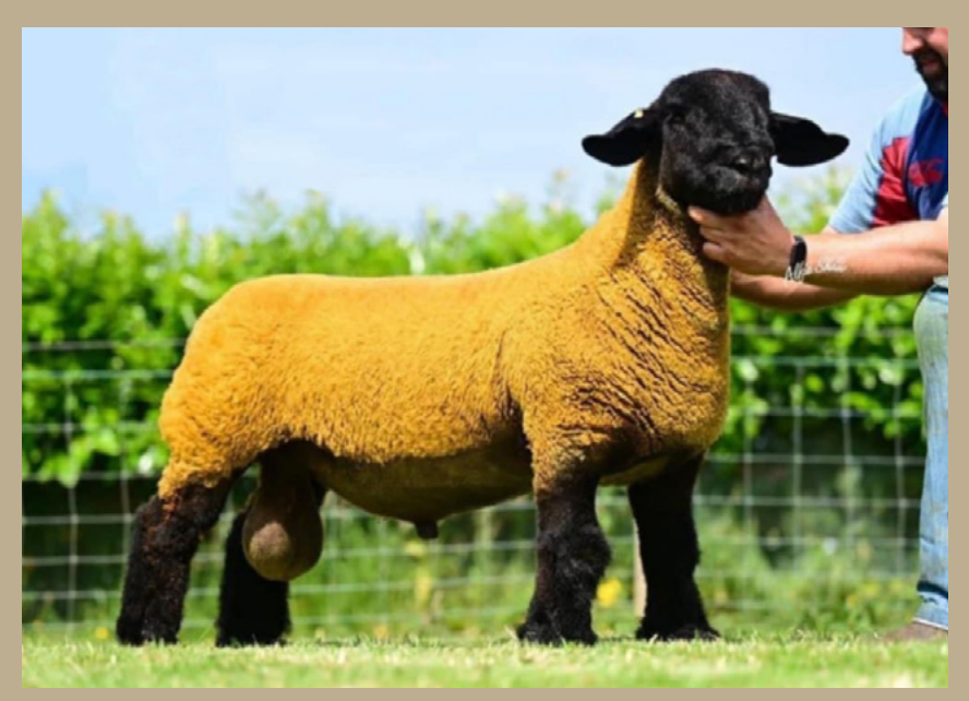
Ballynacannon Rolls Royce, Ballinatone Service Sire.