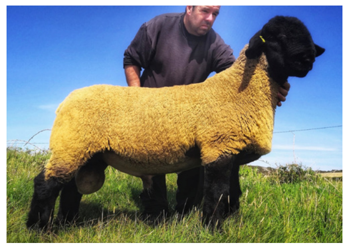
Crewelands Dancing Brave