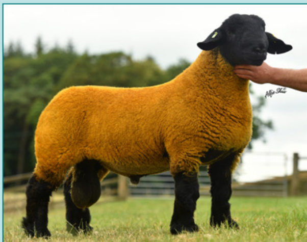
Cairnton Chaos. Purchased at Lanark for 75,000gns

Enquiries are always welcome. Please contact Alan on 086 0797944