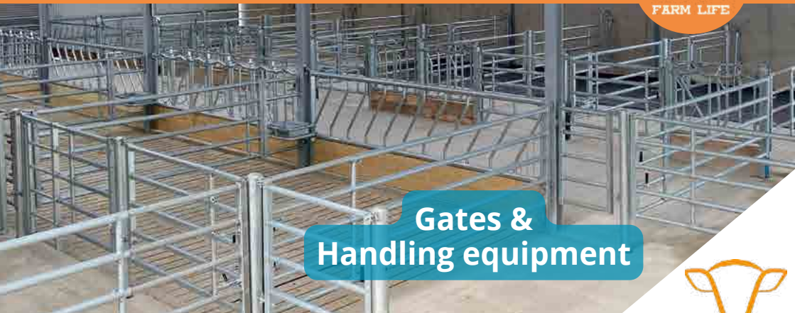
Gates & Handling equipment