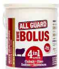
All Guard Ewe 4 in 1

A 6 month continuous slow release bolus for sheep from 16 weeks of age.