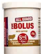
All Guard Ewe 5 in 1

A 6 month continuous slow release bolus for sheep from 16 weeks of age containing copper.