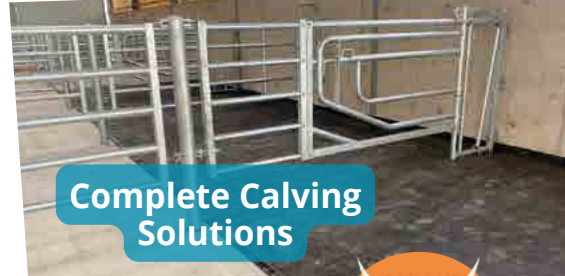
Complete Calving Solutions