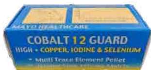
Cobalt 12 Guard High

Slow-release chelated Trace Element Pellet containing Cobalt, Vitamin B12, Copper, Iodine & Selenium for thrive and growth in lambs. (Also available without Copper)