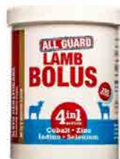
All Guard Lamb 4 in 1

Slow-release bolus for lambs from 6 weeks old.