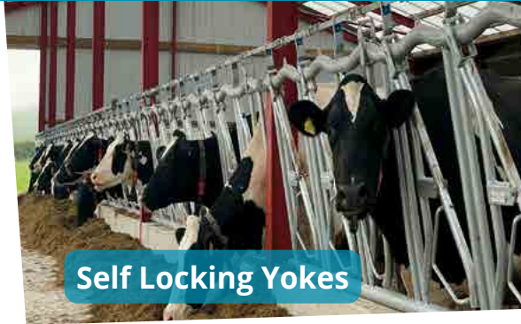
Self Locking Yokes