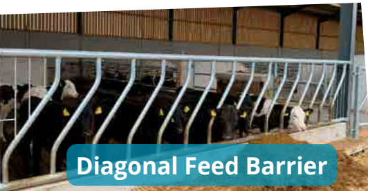
Diagonal Feed Barrier