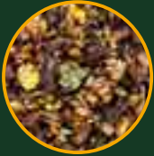
Omega Tup & Lamb

Bespoke course mixes formulated for show winning livestock.