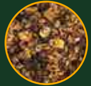
Omega Show Ring