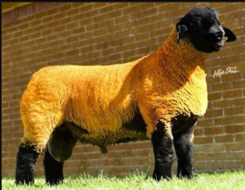
Cloontagh Chieftain €31,000 gns. Sold Roscrea 2015