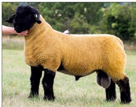
Limestone Aston Martin

Overall Champion Stirling 2018, Reserve Overall Champion Balmoral 2018, purchased jointly for £40,000gns. He has developed into a massive ram and has all the attributes of the modern Suffolk, combined with an excellent back pedigree. The most successful 1st season sire in recent years, with progeny including the Balmoral Champion 2019, the Reserve Champion Stirling 2019, and sons have sold 3200 x 2, 4200 x 2, 5200, 16,000, 20,000, 21,000, 23,000 and many more at 4 figures. Outstanding breeder. Champion stock ram National Flock Competition 2019. Current Sire of the Year (2019)