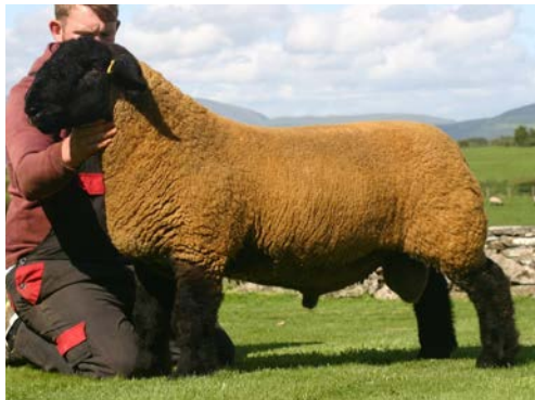
Claycrop Cactus Jack