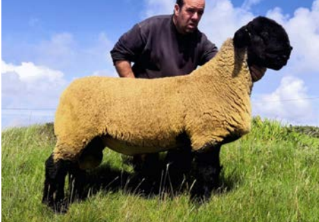
Crewelands Dancing Brave

A ram with tremendous size and presence.