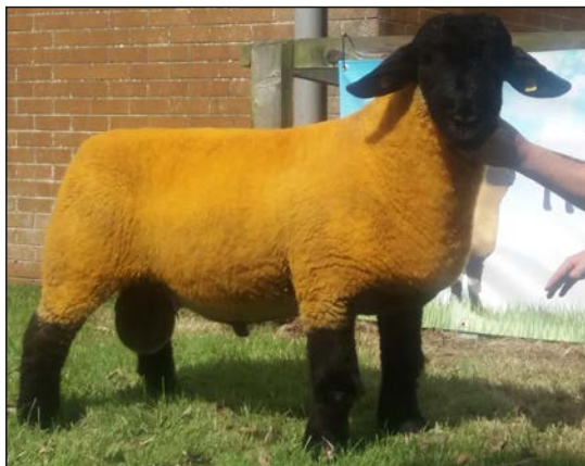
Carragh Caprivate – Sire of Barrowlands Ewe Lamb Lot 53

Purchased for €2800 in 2017 in partnership with Coolamains Flock. Reserve Overall Champion at Roscrea Premier Sale. Very much admired sheep and he has grown on well. A ram with tremendous style and presence. Captivate won the Howard Peel Cup for best stock ram in the Suffolk Society Flock competition in 2018. Has provided us with some fine breeding ewes.