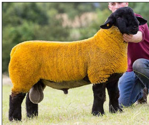
Castleisle Kilteskin Prince – Sire of Ewe lambs Lots 51 & 52

Purchased at Stirling 2019 for 20,000gns in partnership with Kilmacoo, Clyda and Annakisha flocks with Castleisle retaining a share. We are very happy with how he has progressed having grown on very well and retained his flesh and energy. Very easy on the eye and is an exceptional mover. He is sire of our best ram lamb this year, Barrowlands Hugo Boss sold to the Carragh flock with a half share retained. He has also bred some fantastic females with 3 very promising ewe lambs sold to Suffolk Elevage de Nives in Belgium.