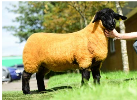
Female Champion, Premier Sale, 2016. Maternal sister to lot 7 (3rd ewe CZK:19:0931)