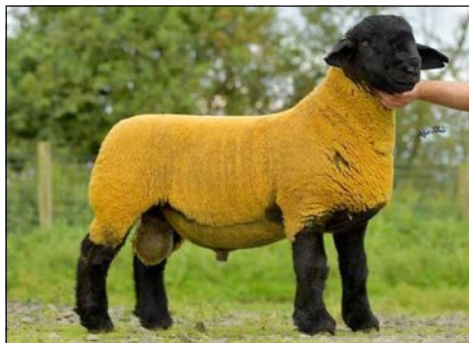
Ballynacannon Royal Flush

Purchased jointly in Stirling 2019 with Ballyboe flock, where he stood eighth in the open class, he has grown on well. A ram with exceptional style, power & colours.