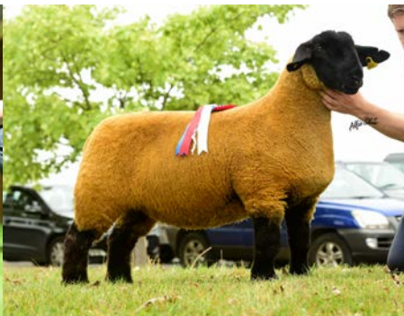
Female Champion, Premier Sale 2018. Maternal sister to lot 7