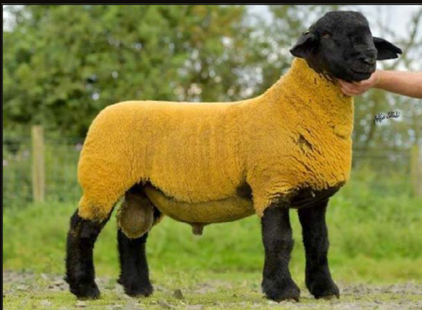
Ballynacannon Royal Flush